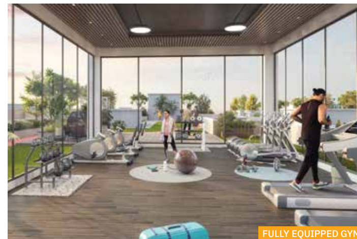
FULLY EQUIPPED GYM