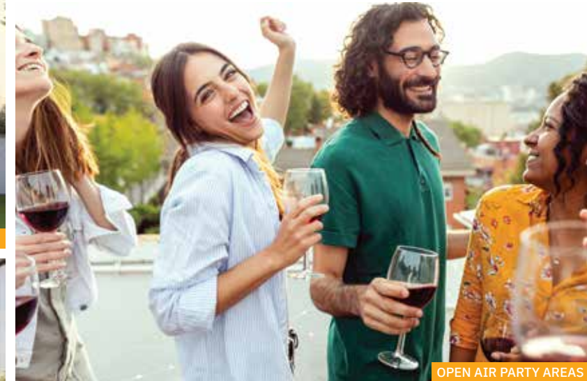
OPEN AIR PARTY AREAS